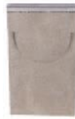
Closing End Cap